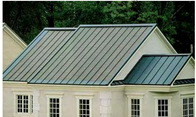
Fig. 1. Roof mounted solar PV panels

After the calculation, the value of the K_{red} is 0,65.