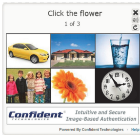
Fig. 2. An example of image-based CAPTCHA

It represents a relatively easy task to be solved by Internet users unlike bots. Fig. 2 illustrates an example of the image-based CAPTCHA.