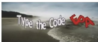
Fig. 4. An example of the video-based CAPTCHA

Video-based CAPTCHA contains text information embedded into the video. Hence, it is a video which includes a passing text given in specific color compared to video background. The user should recognize the given passing text and type it. The modern OCR programs challenge this task, making this CAPTCHA vulnerable to bot attacks. Fig. 4 illustrates an example of the video-based CAPTCHA.