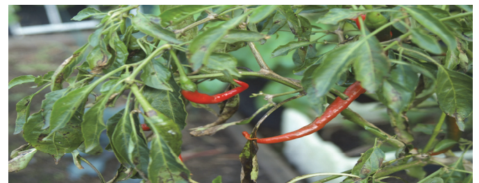
Fig. 6. Diseases on Chilli plant