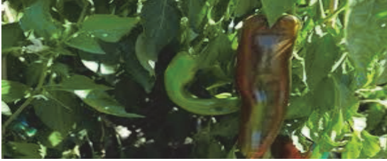
Fig. 4. Diseased Image of Chili [13]

The original value of pixel is included in computation of the median. These filters are quite popular because certain type of random noise, they provide excellent noise reduction capabilities, with considerably less blurring than linear smoothing filter of similar size.