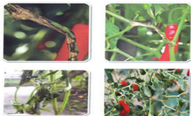
Fig. 1. Samples of plant chilli disease

The remaining paper is organized as below. Section II describes the related work. Detail methodology along with all steps for implementation is elaborated in Section III. An algorithm is presented in Section IV. Results are depicted in Section V and finally conclusions are drawn in Section VI.