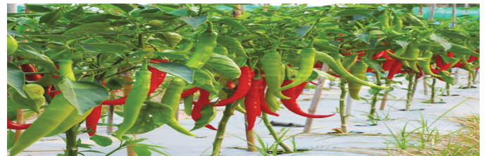
Fig. 5. Healthy of plant Chilli

The imread function is read image from graphics file. The imresize function is to returns an image of the size specified by [m-rows n-cols]. Images are resized for easier image processing [5], [11] MATLAB and LABVIEW software are used for the simulation purpose, LABVIEW is an advance software [12] used for the simulation and GUI formation.