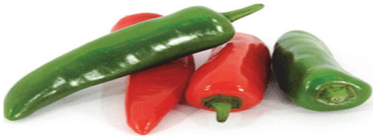
Fig. 3. Healthy Image of Chilli [13]

techniques to implement general purpose automated leaf recognition for plant classification is suggested in [3]. Class-based" image based recognition and rendering with varying illumination can also be an alternative approach suggested where a single input image of an object, and a sample of images with varying illumination conditions of other objects of the same general class, re-render the input image to imulate new illumination conditions [4]. In color constant indexing is a simple method proposed in [5], where objects can be recognized on the basis of their color only. Since the ratios of color RGB triples from nearby locations are insensitive to the changes. Suggested algorithms and mathematical computations are also proven very useful in analysis [6-7]. A novel shape recognition method based on radial basis probabilistic neural network (RBPNN) is presented [8]. This method uses orthogonal least square algorithm (OLSA) to train the RBPNN and the recursive OLSA is adopted to optimize the structure of the RBPNN.