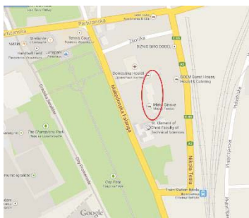
Fig. 1. Location of the high school dorm “Mirka Ginova” in Bitola

The building of the dorm is located in the south-eastern part of the city of Bitola. The object does not have attached building to it, located in averagely urbanized part of the city, next to the city park, bus station and railway station. It was built in 1960 and significant reconstruction and extension took place in 1994. Main entrance of the building is on the south-western side (Fig. 1).